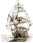
Around the Horn