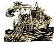
Fishing Coastal Waters